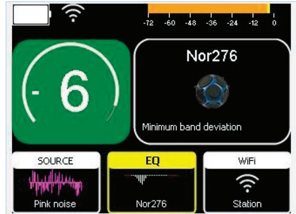
Predefined spectrum shape for Norsonic speakers

The output signal including the equalized spectrum shaping is displayed in real time on the colour display, including a separate bargraph on the top of the spectrum indicating the overall noise level.